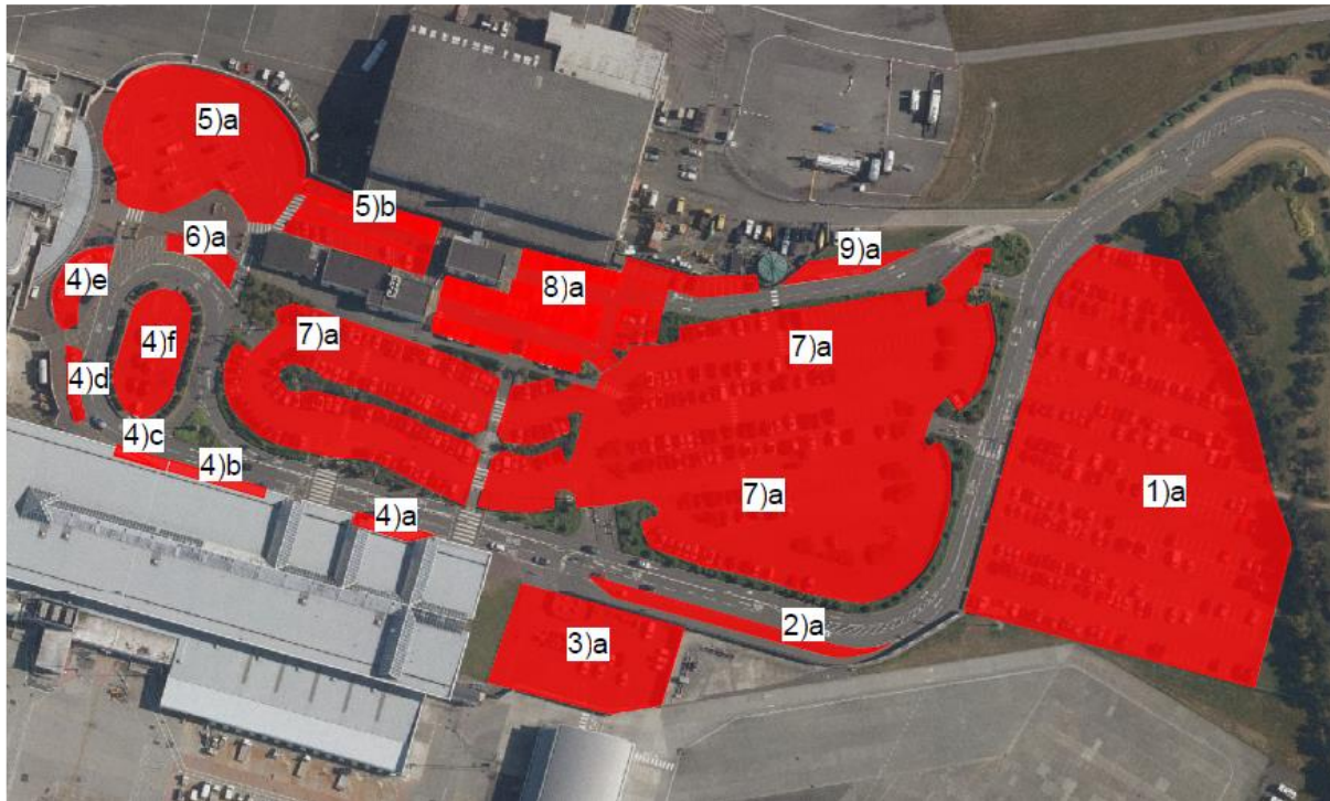
Airport Parking Area Overview 1a to 9c