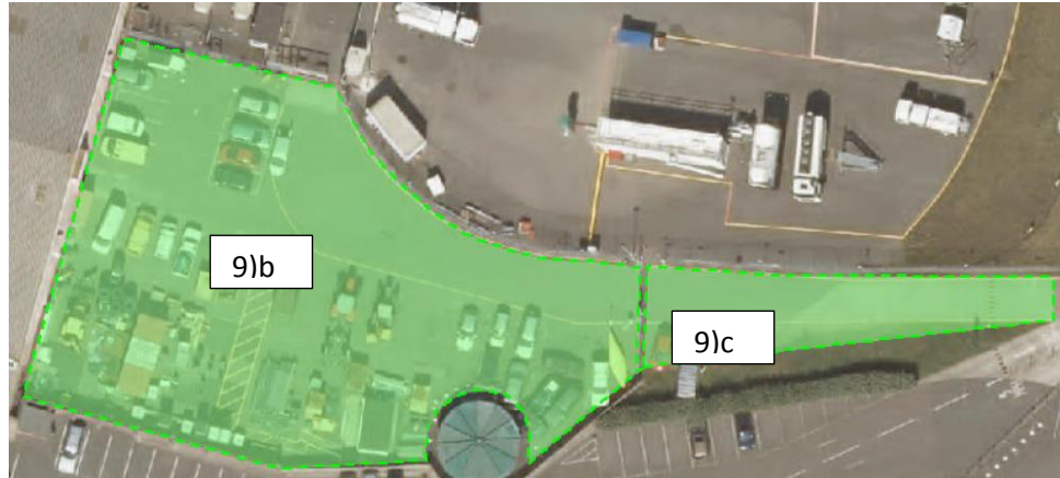
Airport Parking Area Overview 10a (Le Guet)