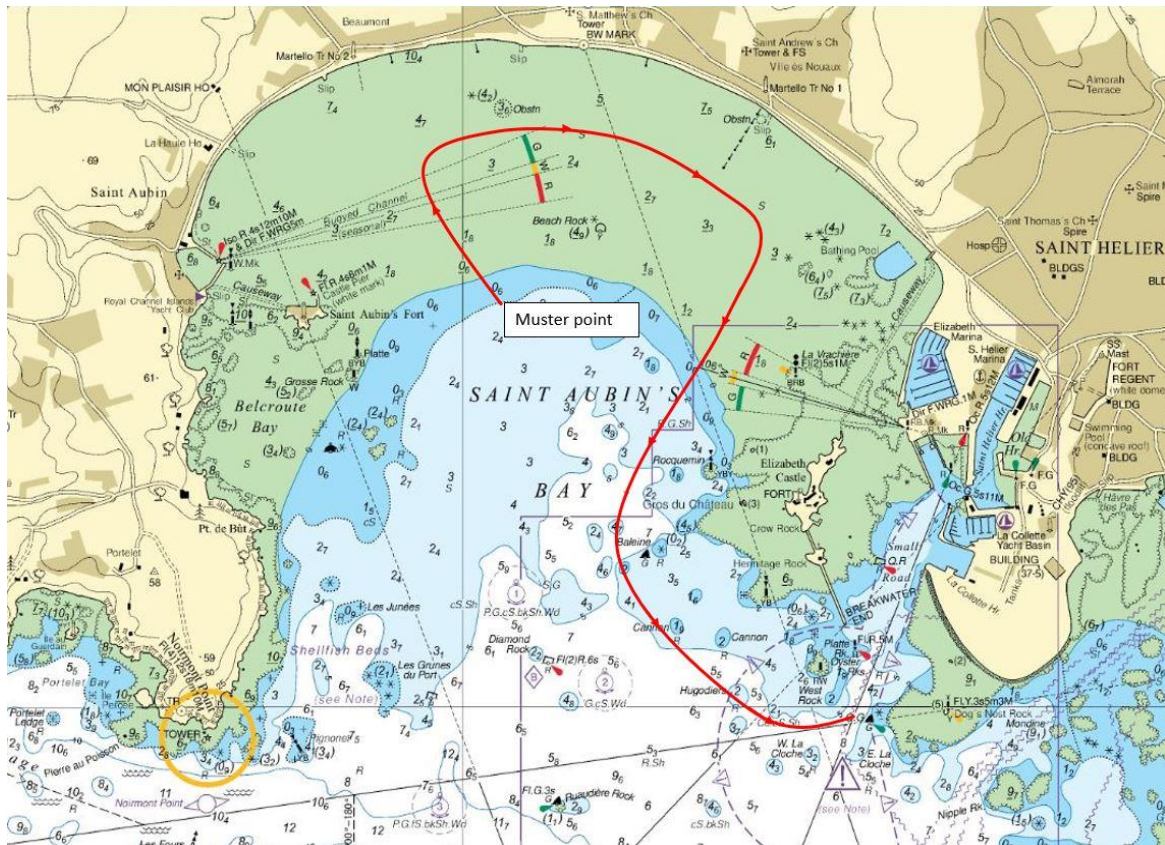
Fig.2. Chartlet highlighting St Aubin's Bay parade route. Not to be used for Navigation.

Captain Bill Sadler Harbour Master, Jersey Harbours