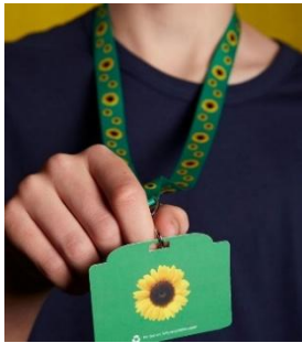
Before going through the scanning process

If you have a hidden disability sunflower lanyard or wristband, please keep them on when travelling through security. This will help make sure you receive the necessary support from the security team.