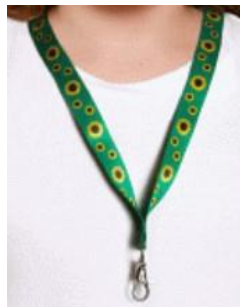
During the scanning process