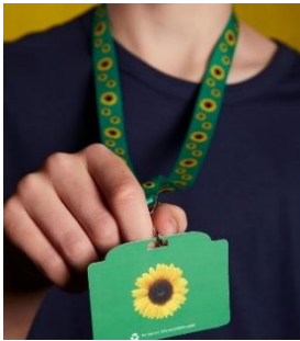
Before going through the scanning process

If you have any items attached to your lanyard or pin badges, you will need to remove them and put them into the security trays with your other items before entering the body scanners.